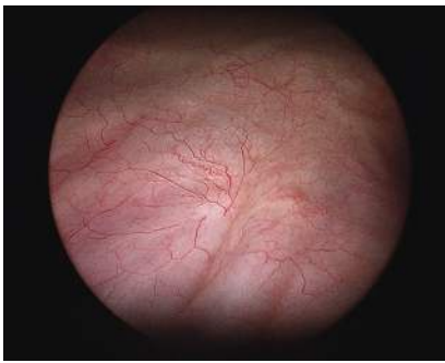
Normal Bladder at Cystoscopy

There is a small risk of developing a urinary tract infection after the test. It is advisable to drink extra fluid after the procedure,